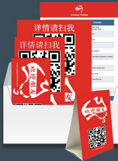
QR CODE SIGNAGE PACK